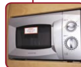
Cooking equipment includes a microwave oven, plus a four-burner hob – good spec for the price