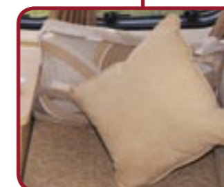
Fawns and creams are here as in the majority of caravans, but with grey to lighten the tone