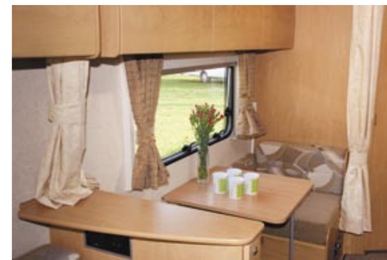
The table-store top is designed to accommodate a flatscreen television

Axes: 1 Berths: 4 MRO: 1079kg MTPLM: 1281kg Width: 2.19m Overall length: 6.78m Headroom: 1.9m