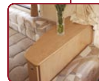
The heavy cotton cream curtain that hangs at the back of the table-store cabinet is of exceptional quality